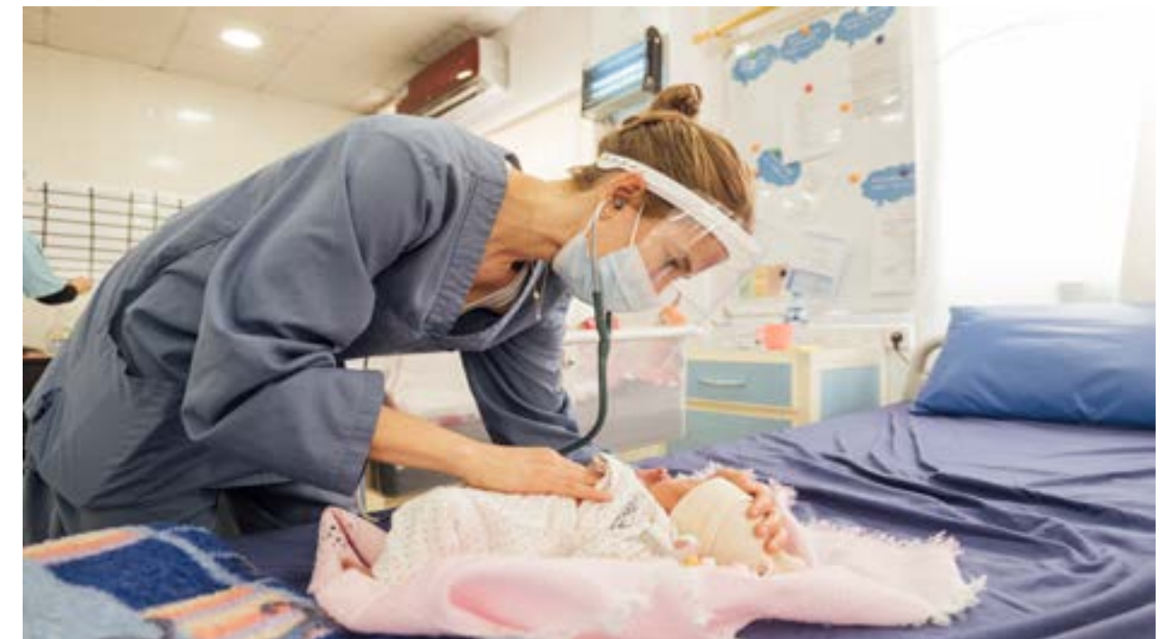
In Nablus hospital, West Mosul, an MSF Jordanian paediatrician examines a newborn, 2021.

In August 2021, following the recovery of some healthcare facilities in Nablus, we changed the admission criteria for the emergency room to paediatric patients only. Our team in Nablus field hospital conducted 2,159 deliveries by caesarean, assisted in a further 8,653 normal deliveries, performed 36,570 emergency room consultations, treated 2,238 children in the inpatient ward, and provided 2,871 individual mental health consultations. We also ran 10 training sessions on triage, on infection and prevention control, and on critical case management for the Directorate of Health staff in Mosul general hospital in 2021, reaching a total of 196 participants.