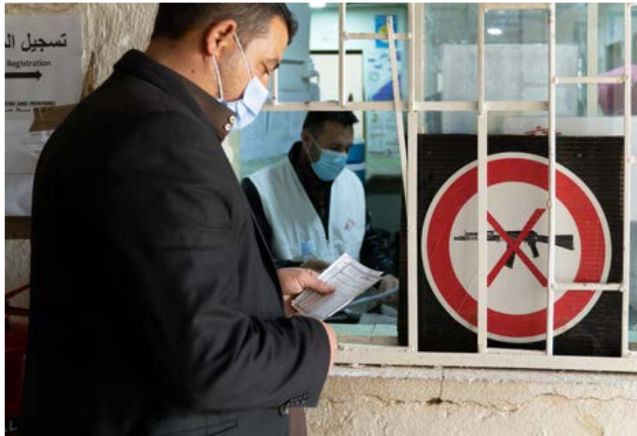
In Hawija General Hospital, a patient suffering from chronic condition is visiting the MSF-run clinic for chronic diseases for routine check-up and to receive his medications. 2022