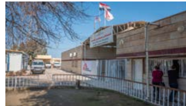
In front of the Sinuni general hospital supported by MSF Sinjar district, 2020

Since August 2018, when our team first rehabilitated and reopened Sinuni general hospital, we have provided emergency care and referral services, maternity care, inpatient paediatric and neonatal care, and comprehensive mental healthcare services and health education to the population of Sinuni and its surroundings. In September 2021, MSF handed back the maternity and paediatric healthcare services to Sinuni general hospital's management after training Directorate of Health staff in these specialties over the past three years. In response to the COVID-19 pandemic, our team continued implementing triage and referral procedures for patients with respiratory symptoms. We also established a seven-bed stabilisation and observation unit for mild and moderate COVID-19 patients with a referral system for severe and critical patients to other hospitals for more advanced care. In 2021, MSF conducted 21,331 emergency room consultations, provided 8,719 sexual and reproductive health consultations (including antenatal, postnatal and family planning consultations), admitted 354 children for inpatient treatment, assisted in 451 births and provided 4,659 individual mental health consultations.