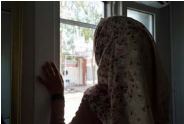
A patient at the MSF attending the MSF-run mental healthcare program in Al-Karama primary healthcare centre in Mosul, 2021.

Throughout Iraq, the need for mental health support services remains very high. In addition to the integrated mental health component in most of our medical facilities, MSF continued to run dedicated mental health support activities in Mosul's Al-Karama primary healthcare centre and, in parallel, in 17th of July primary health centre. In 2021, MSF teams provided 408 individual mental health consultations in these two health centres.