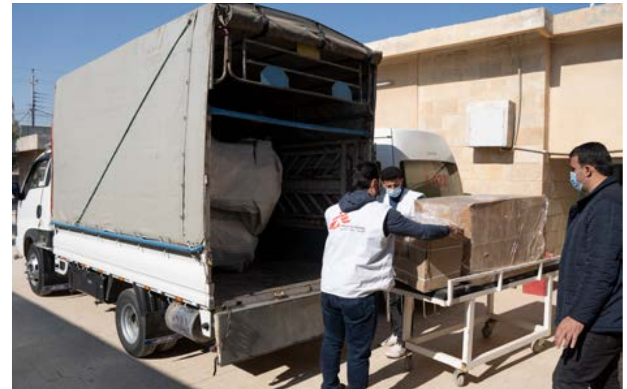
MSF's logistics team delivering donations to the Qushtapa Primary Healthcare Centre after fully rehabilitating the facility from the damages it sustained during December's flash floods in 2021.

Following flash floods that severely damaged infrastructure and thousands of homes and other buildings in southern Erbil governorate on 17 December 2021, MSF responded by rehabilitating Qushtapa primary healthcare centre and providing emergency support, including donating medical supplies, training staff and improving the healthcare centre's waste management system.