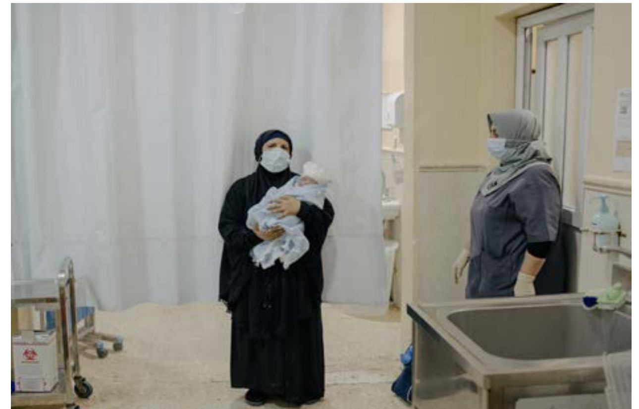
In the maternity ward of Nablus hospital, West Mosul, a woman holds her grandson, 2021.

More than four years have passed since the end of the war against the IS group, but its devastating impact is still felt in Ninawa. Throughout 2021, more than 250,000 people from Ninawa were still displaced from their homes. The population's psychological trauma remains largely unaddressed. And despite ongoing reconstruction efforts, many of the health facilities destroyed during the conflict have yet to be rebuilt and to resume their activities. In 2021, the COVID-19 pandemic continued to complicate the situation further, causing health facilities to suspend their activities and overwhelming those facilities that remained open. In response, MSF helped local health authorities with direct COVID-19 patient management, conducted health education campaigns, enhanced infection prevention and control measures and implemented patient management, triage and referral procedures for patients with respiratory symptoms in all its medical facilities. Our teams continuously monitored people's health needs and adapted the level of care we provided in our projects to the changing needs and the pace of recovery of the healthcare system.