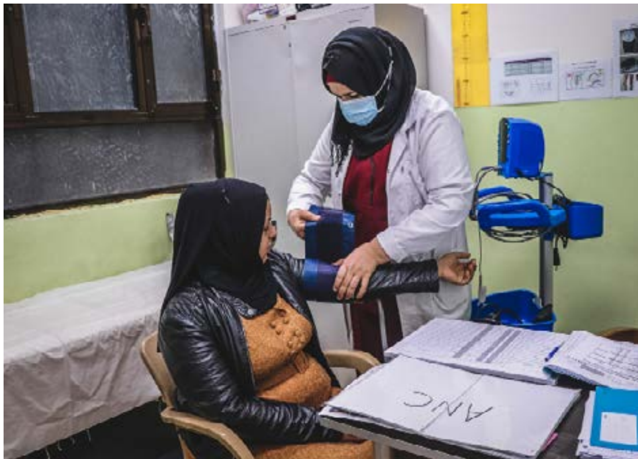
Midwife checking blood pressure of a pregnant women in Al Amal maternity, West Mosul, 2022

In Al-Rafidain primary healthcare centre in West Mosul, MSF runs Al-Amal maternity clinic. Our teams there provide sexual and reproductive healthcare services, such as non-surgical obstetric and maternity care, antenatal and postnatal consultations and family planning services. In 2021, our teams assisted in 4,418 deliveries and provided 9,112 antenatal and 1,235 postnatal consultations and 6,199 family planning consultations. They also provided 7,368 mental health consultations and 903 health education sessions.