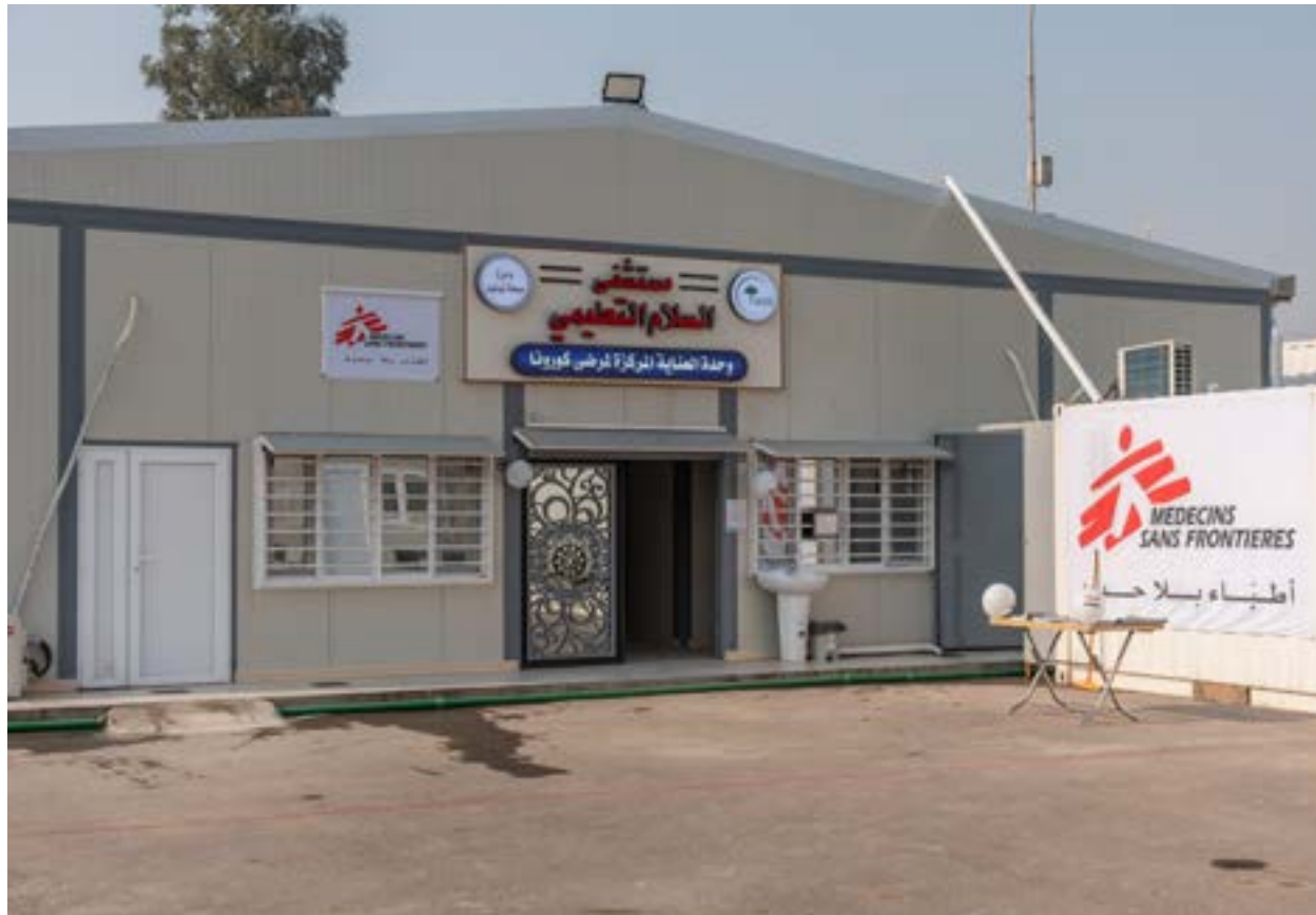
The entrance of the MSF-supported COVID-19 intensive care unit at Al-Salam General Hospital, East Mosul, 2020.

MSF opened and ran a 16-bed COVID-19 intensive care unit in collaboration with Ninawa Directorate of Health at Al-Salam hospital, East Mosul. The facility offered advanced comprehensive care for critical and severe cases of COVID-19 as well as mental healthcare for both recovering patients and their caregivers. MSF ran the facility until March 2021 and then handed over its activities to the Directorate of Health as patient numbers dropped. The facility was equipped with ventilation and oxygen machines to ensure oxygen provision for patients with acute respiratory symptoms. Our teams cared for 33 severely and critically ill COVID-19 patients and provided 106 individual mental health counselling sessions.