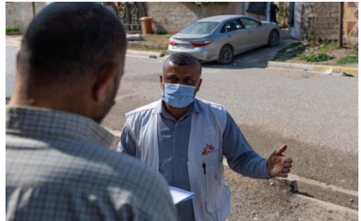
Health promotion session in one of the neighbourhoods of Hawija district, 2022