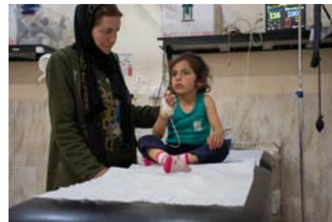
A little girl and her mother at the emergency ward of the Sinuni hospital, Sinjar district, 2020. Her parents brought her to the hospital to receive care for her broken arm