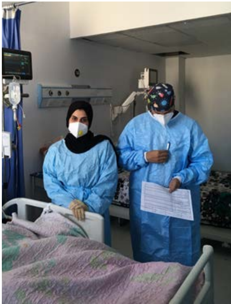
In the MSF-supported COVID-19 intensive care unit at the Baghdad Medical City, the team is running their regular morning visit to check up patient's progress, 2022.

To continue supporting the health system in Baghdad in its response to the COVID-19 pandemic, MSF teams moved from Al-Kindi hospital to Baghdad Medical City in October 2021. At Baghdad Medical City, our teams worked with hospital staff at Al-Shifaa Intensive Respiratory Care Centre to provide a comprehensive intensive care package, including ventilation therapy, medical care, nursing care, physiotherapy and mental healthcare. MSF also supported the health authorities by running health promotion activities to help counter misinformation about COVID-19, including vaccinations, and to guide people towards evidence-based information. From October to December 2021, MSF treated 39 patients at Baghdad Medical City and provided 82 training sessions to healthcare providers at the facility.