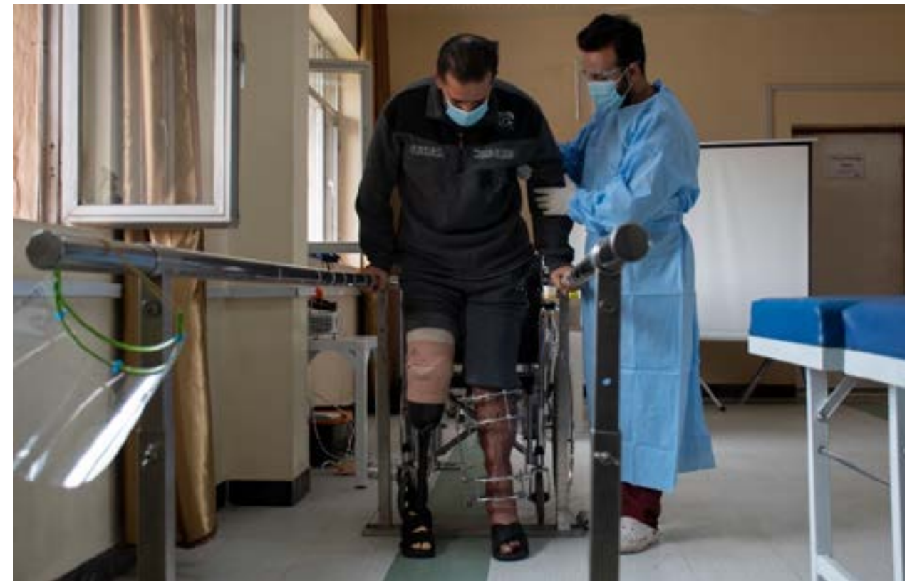
A post-surgical patient at the MSF-run Baghdad Medical Rehabilitation Centre during a physiotherapy session following several surgeries to stabilize his fractures, 2021

MSF opened the Baghdad Medical Rehabilitation Centre in August 2017 to provide comprehensive post-operative rehabilitation care for people with trauma injuries caused by violence or accidents. The facility is equipped with a 20-bed isolation ward and provides medical care, nursing care, pain management, physiotherapy, antimicrobial-resistant infection care and mental health support to post-surgical patients referred from other hospitals. After their recovery, patients return to the facility's outpatient department for follow-up care, including physical and psychological rehabilitation sessions. In 2021, we treated 245 patients as inpatients and provided 11,992 outpatient consultations (medical, nursing, physiotherapy) including 3,040 mental health consultations (including 187 psychiatric sessions).