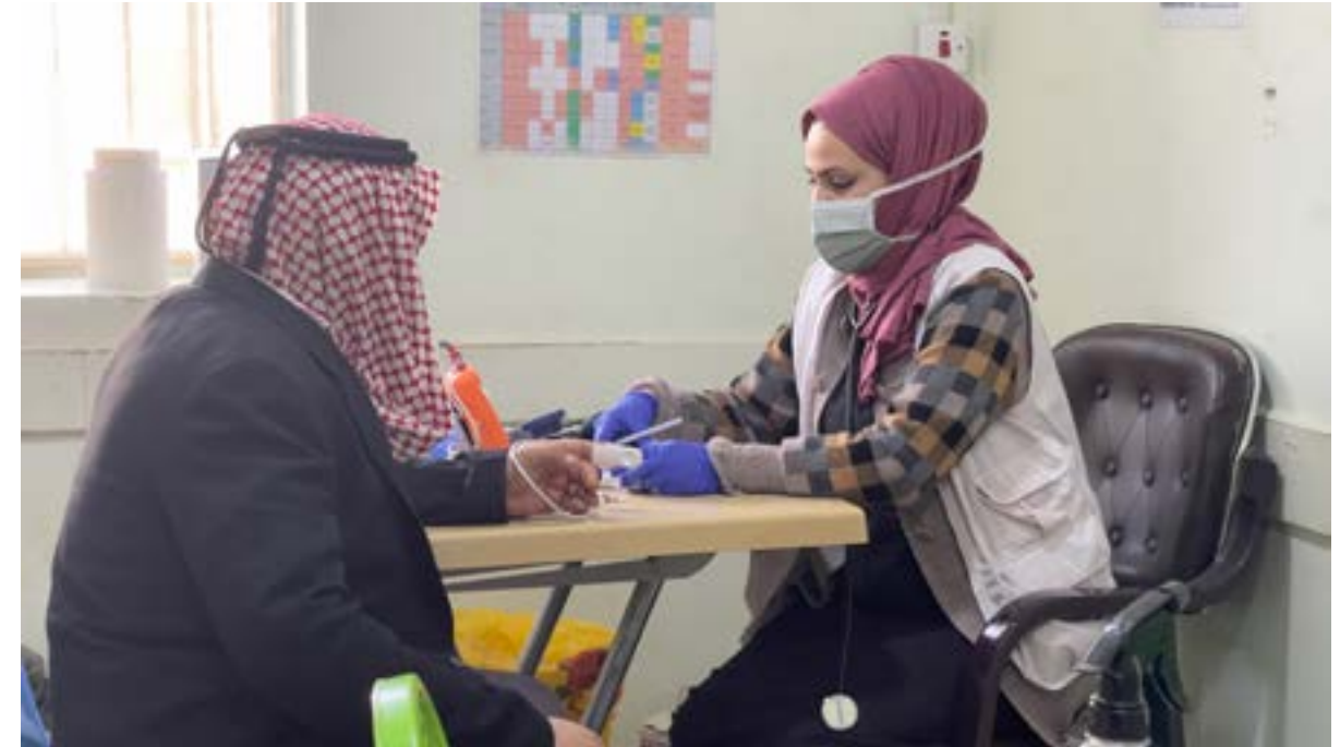
An MSF nurse is examining the vital signs of a patient suffering from a chronic disease at the MSF-run clinic for chronic diseases in the Hawija General Hospital, 2022.

MSF started supporting the population in Hawija and Al-Abbasi in 2018, initially running mobile clinics for displaced people in Maktab Khalid and Dibis, then supporting the emergency department at Hawija hospital and rehabilitating the primary healthcare facilities in both Hawija and Al-Abbasi. MSF went on to provide other services including much-needed care for people with non-communicable diseases such as hypertension and diabetes; maternity care (including antenatal and postnatal services and family planning); mental healthcare; and health education services. In 2021, MSF provided 24,856 non-communicable disease consultations, 3,152 sexual and reproductive health consultations, 6,214 individual mental health consultations and 1,357 group mental health sessions in Hawija and Al-Abbasi