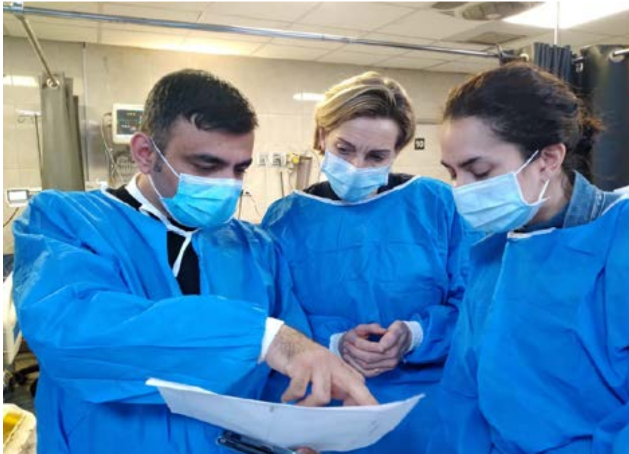
An MSF team is checking a patient file at the MSF-supported COVID-19 intensive care unit at the Baghdad medical city, 2022

MSF continued to provide post-operative rehabilitation care and to support the National Tuberculosis Institute (NTI) in Baghdad to offer a new regimen for treating patients with drug-resistant tuberculosis, with the aim of helping the Iraqi Ministry of Health provide new models of care that can be replicated in other governorates. With the Iraqi capital particularly hard hit by COVID-19, MSF also helped the health authorities strengthen their response to the pandemic.