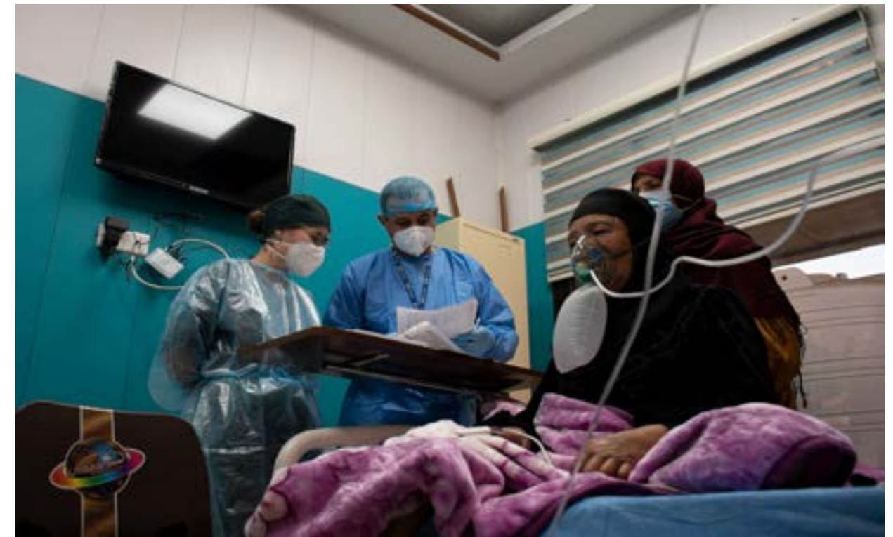
A COVID-19 patient is receiving oxygen therapy in the Al-Shifaa 13 COVID-19 ward, in Al-Kindi Hospital, Baghdad, 2021

In 2021, MSF teams continued supporting the Rusafa Directorate of Health by treating COVID-19 patients at the 33-bed Al-Shifaa Intensive Respiratory Care Centre at Al-Kindi hospital. In response to increasing numbers of COVID-19 admissions during the second wave of the pandemic, MSF and the hospital management team worked together to expand capacity to 55 beds. Our teams delivered comprehensive intensive care to severely and critically ill COVID-19 patients, including ventilation therapy, medical care, nursing care, physiotherapy and mental healthcare. Our teams also provided training sessions and essential medical supplies to health workers at Al-Kindi hospital. They also introduced an antibiotic stewardship programme at the hospital to better manage antibiotic use with COVID-19 patients. In October 2021, MSF handed over its activities at Al-Kindi to the hospital’s management, following a decision by the Directorate of Health of Rusafa to return the hospital to surgical activities after focusing on COVID-19 care for more than a year. In 2021, we provided advanced COVID-19 care for 936 patients, provided 2,730 physiotherapy sessions and trained 225 Directorate of Health staff. MSF also donated essential personal protective equipment to healthcare facilities across Baghdad.