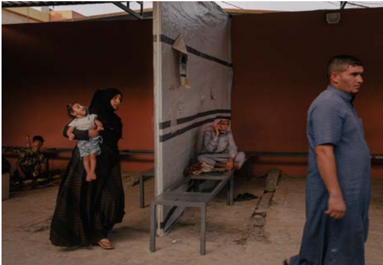
In the waiting area of Nablus hospital, West Mosul, 2021.