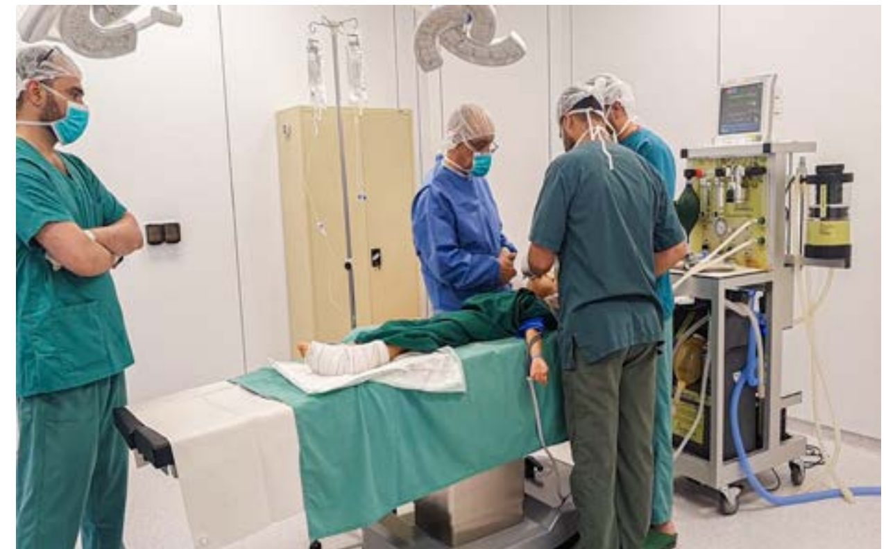
A patient being prepared for operation at Al-Wahda hospital, East Mosul, 2021.

To address the shortage of skilled surgery and post-surgical care, since 2018 MSF has run a comprehensive facility for patients with violent or accidental trauma injuries in East Mosul. Starting from one mobile operating theatre and a 33-bed inpatient ward in 2018, the hospital expanded to two permanent and fully equipped operating theatres and 40 individual isolation rooms, recovery rooms and rehabilitation units in 2021. Following the hospital's expansion, we also expanded the admission criteria to include patients needing treatment for complex fractures, corrective surgeries and bone infection surgeries. In 2021, our teams conducted 1,111 surgical interventions, 7,888 outpatient consultations and 891 inpatient consultations and 52,116 people benefited from health education sessions.